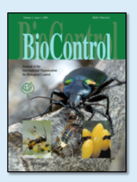
2012 Impact Factor -2.215