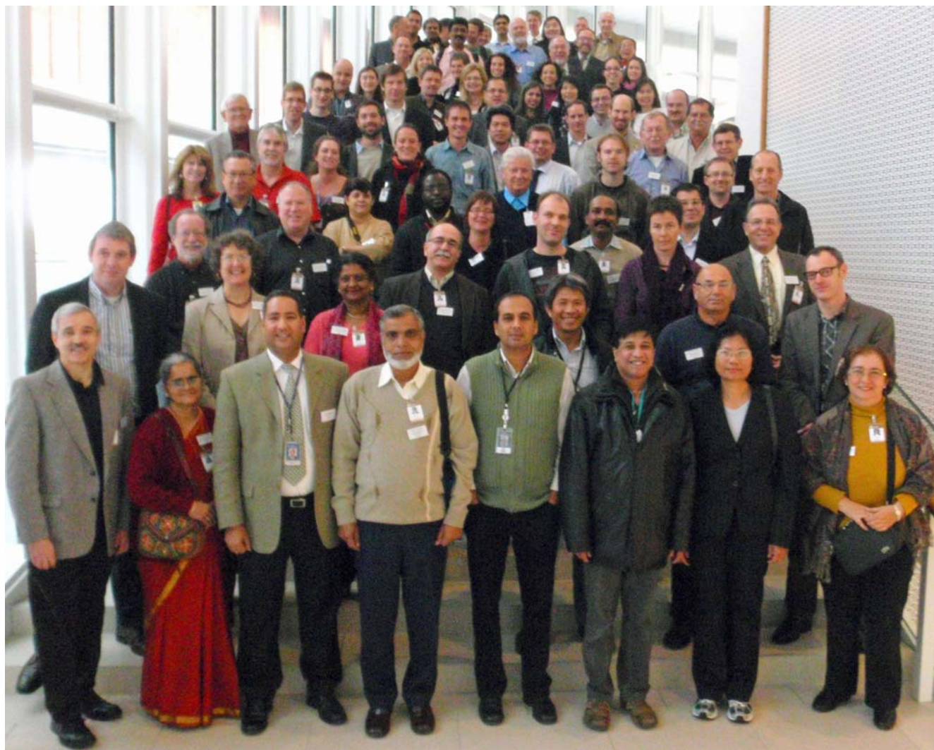
Participants of the 12th workshop of the IOBC Global Working Group on Arthropod Mass Rearing & Quality Control (AMRQC) in Vienna, Austria, October 2010

http://www-pub.iaea.org/MTCD/Meetings/Announcements.asp?ConfID=38586