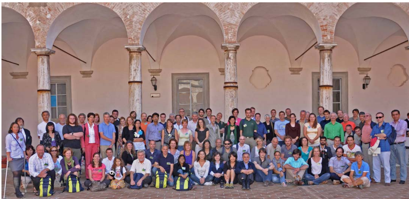
Participants at the 11 th meeting of the IOBC Global Working Group Ecology of Aphidophaga in Perugia, Italy, September 2010